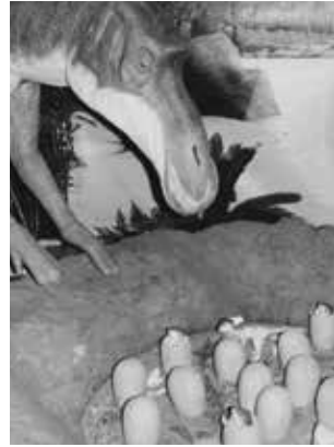
The eggs of even the largest dinosaurs were no bigger than a football, so all young dinosaurs were quite small.

One commonly raised problem is, ‘How could Noah fit all those huge dinosaurs on the Ark?’ First, of the 668 supposed dinosaur genera, only 106 weighed more than ten tonnes when fully grown. Second, the Bible does not say that the animals had to be fully grown. The largest animals were probably represented by ‘teenage’ or even younger specimens. It may seem surprising, but the median size of all animals on the Ark would most likely have been that of a small rat, according to Woodmorappe’s up-to-date tabulations, while only about 11 percent would have been much larger than a sheep. See also Chapter 19.