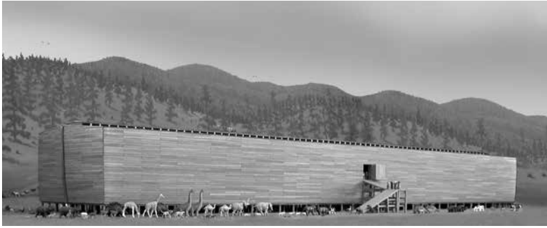
God brought to Noah all kinds of air-breathing land animals to be saved from the Flood.

vegetation, as seen today after severe storms. Many insects and other invertebrates were small enough to have survived on these mats as well. According to Genesis 7:22, the Flood wiped out all land animals that breathed through nostrils except those on the Ark. Insects do not breathe through nostrils but through tiny pores (‘tracheae’) in their exterior skeleton (‘shell’).