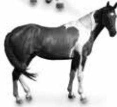
Zebras, donkeys, and horses—probably one biblical kind.