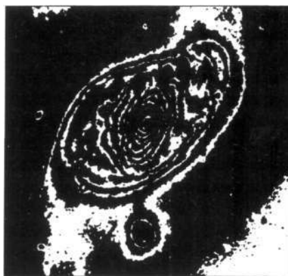
Figure 1. Isophote image of the galaxy NGC4319 (top) and the quasar Markarian 205 (bottom) clearly showing the 'mystery' luminous bridge connecting them (north is up, east is left).

'If Arp is correct [about red-shifts not being distance indicators], if his observations are confirmed, he will have single-handedly shaken