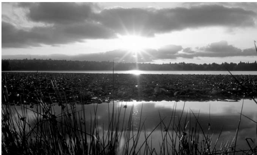
'And the evening and the morning was Day One'—Gen. 1:5. Ancient Hebrews certainly had words they could have used instead of yôm to describe something other than a solar day. Words such as olam or qedem in conjunction with yôm could have been used to say 'it was from days of old'.

'Since state-of-the-art technology has made it possible for the earth to speak to us in amazingly sophisti-