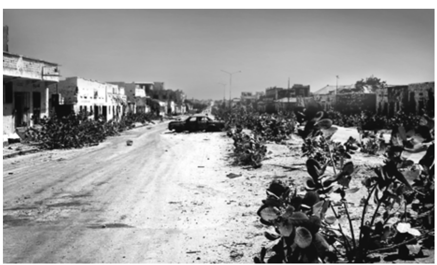
Figure 1. An abandoned Mogadishu street in 1993. Mogadishu had once been a beautiful city and a popular destination for tourists.

Chapter 11 is entitled, "Are atheist states not actually atheist?" in which Peter responds to his brother's argument that Joseph Stalin's Soviet